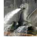
20. Sea Horse Fountains Carl Paul Jennewein 414 East 12th St.