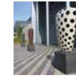
41. Water Plaza Jun Kaneko 16th St. between Central and Wyandotte