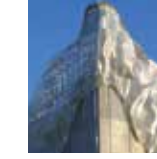
47. Winds of Aphrodite Suikang Zhao 12th and Broadway