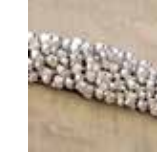
37. Barnacles Rie Egawa + Burgess Zbryk 1250 Walnut St.