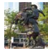
12. Bronco Buster Unknown (Enlarged Frederick Remington replica) 12th and Wyandotte