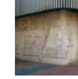
50. Builders Constantin Nivola 601 East 12th St.