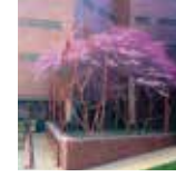
23. Shadow Garden Steven Whitacre 506 E. 13th St.