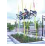
44. Exposed Structures (system mapping) Stuart Keeler 2nd and Main