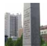
5. City Employees Memorial Frewen Architects, Inc. 11th and Oak