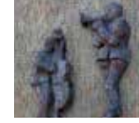
27. Jazz Musicians Dorothy Powers 811 Main