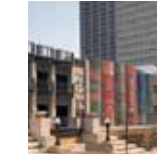
46. Community Bookshelf 360 Architecture + BNIM 14 W 10th St.