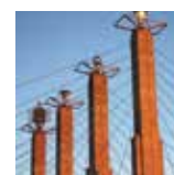
15. Sky Stations R. M. Fischer Truman Road and Interstate highway I-670