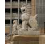
21. Chinese Lions (Ti and Wei) n/a 414 East 12th St.